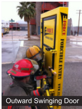
Outward Swinging Door